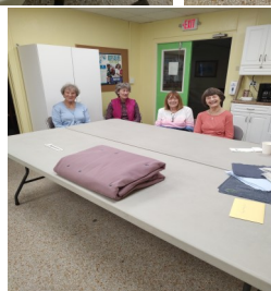
Some of the Quilters finishing up their latest Creation!