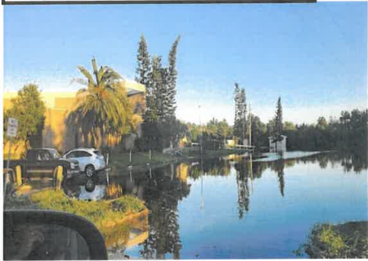
The Parking Lot—Lake Grace